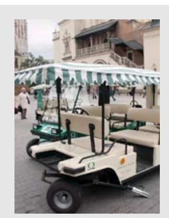
Above: Choose between getting in one, or constantly having to avoid the little menaces... Left: Faster driver, faster! Below:

The big trick of taking taxis in Cracow is to avoid taking one from a rank on the street. You will pay 30 percent less if you order one by phone. This leads to the bizarre sight of people with mobiles ringing whilst standing next to the taxi they wish to take. A minute later, following clearance from ground control, and the punters are on their way! If you are looking for a reliable taxi service, either to the airport airport or elsewhere in town then you can use Cracow-life.com's online taxi booking to reserve your ride. Alternatively call 9191 when you arrive and tell the operator that Cracow Life sent you! Please note that taxis cannot be hailed from the street whilst they are moving. You will be ignored!